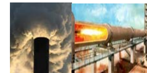
Carbon capture from the burning of fossil fuels and manufacture of Portland cement.